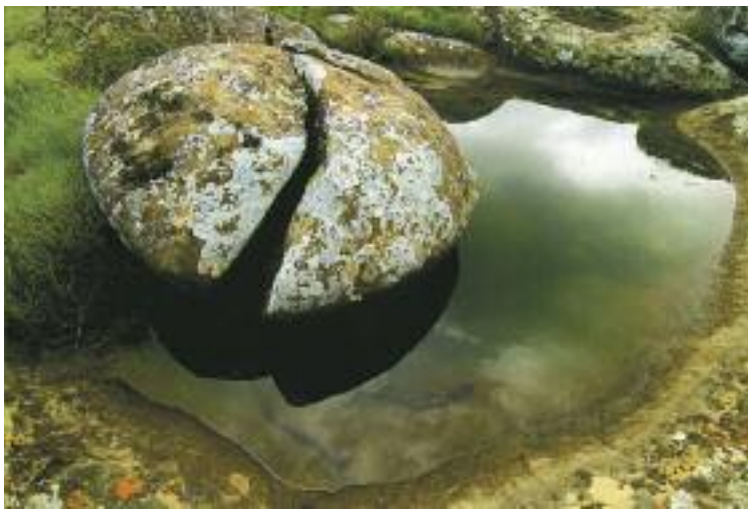
"Black Meadow Pool"